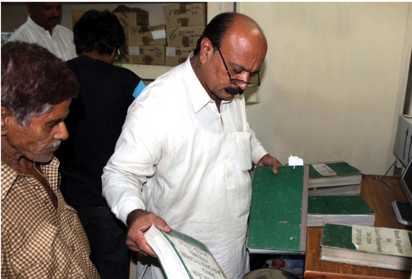
Tax collector in Pakistan

Tax rates depend on location and usage; the level of facilities and infrastructure in the area; residential, commercial, or industrial status; and whether the property is rented or owneroccupied. Tax collectors can easily reclassify properties within these categories, with substantial effects on the tax rate. For example, owner-occupied properties are taxed at a tenth the rate of rented units. In this system, officials may accept side payments in exchange for lowering owners' tax burdens by incorrectly assessing properties.