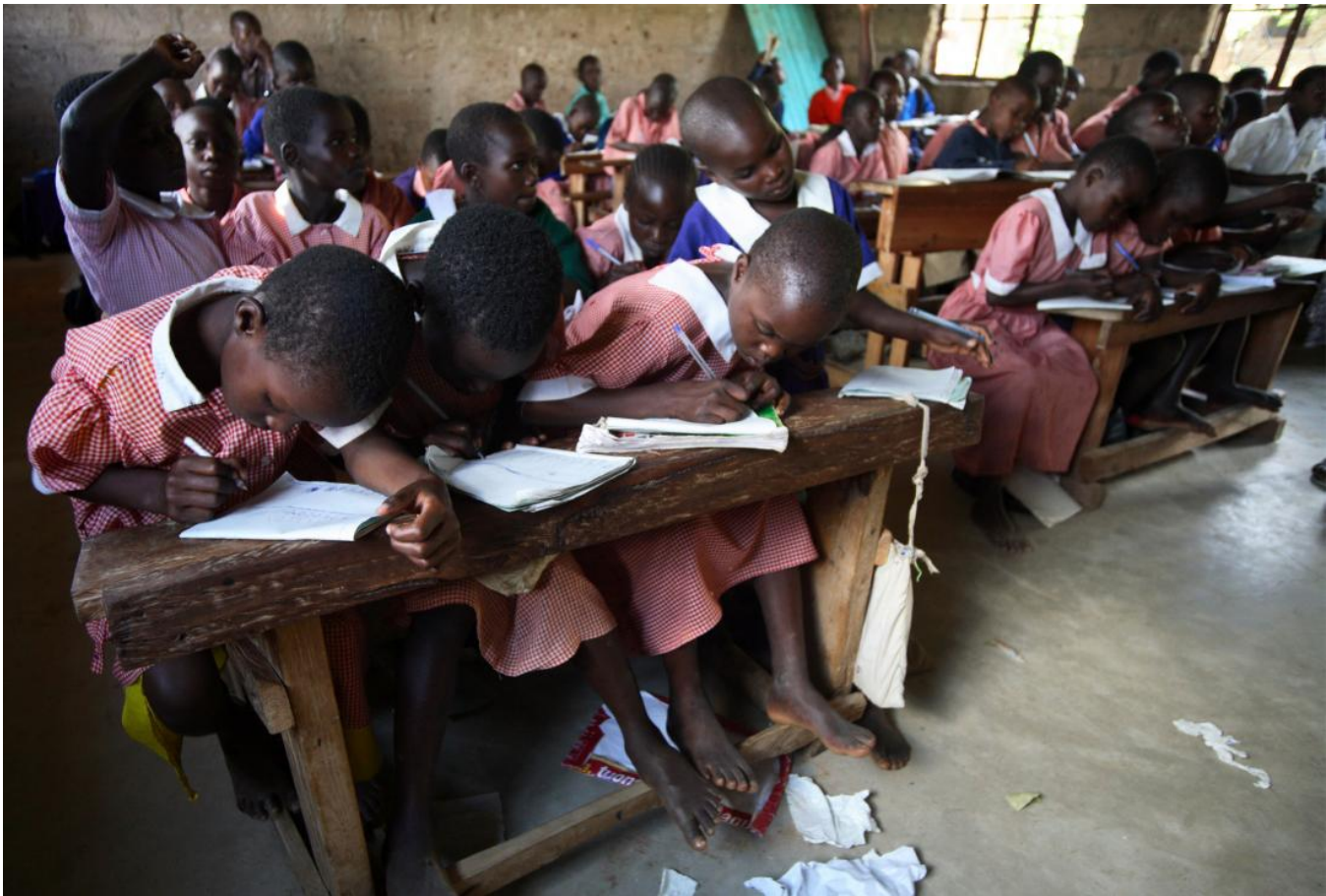
Students concentrate on a test in Kenya.

far—students must be met with a motivated teacher in their classroom. This is often not the case in Kenya; in Busia and Teso districts, teachers are absent on average 20 percent of the time. Teachers’ salaries depend on their education and experience, with no opportunity for performance-based promotion, which appears to result in a system with no incentives to teach well.