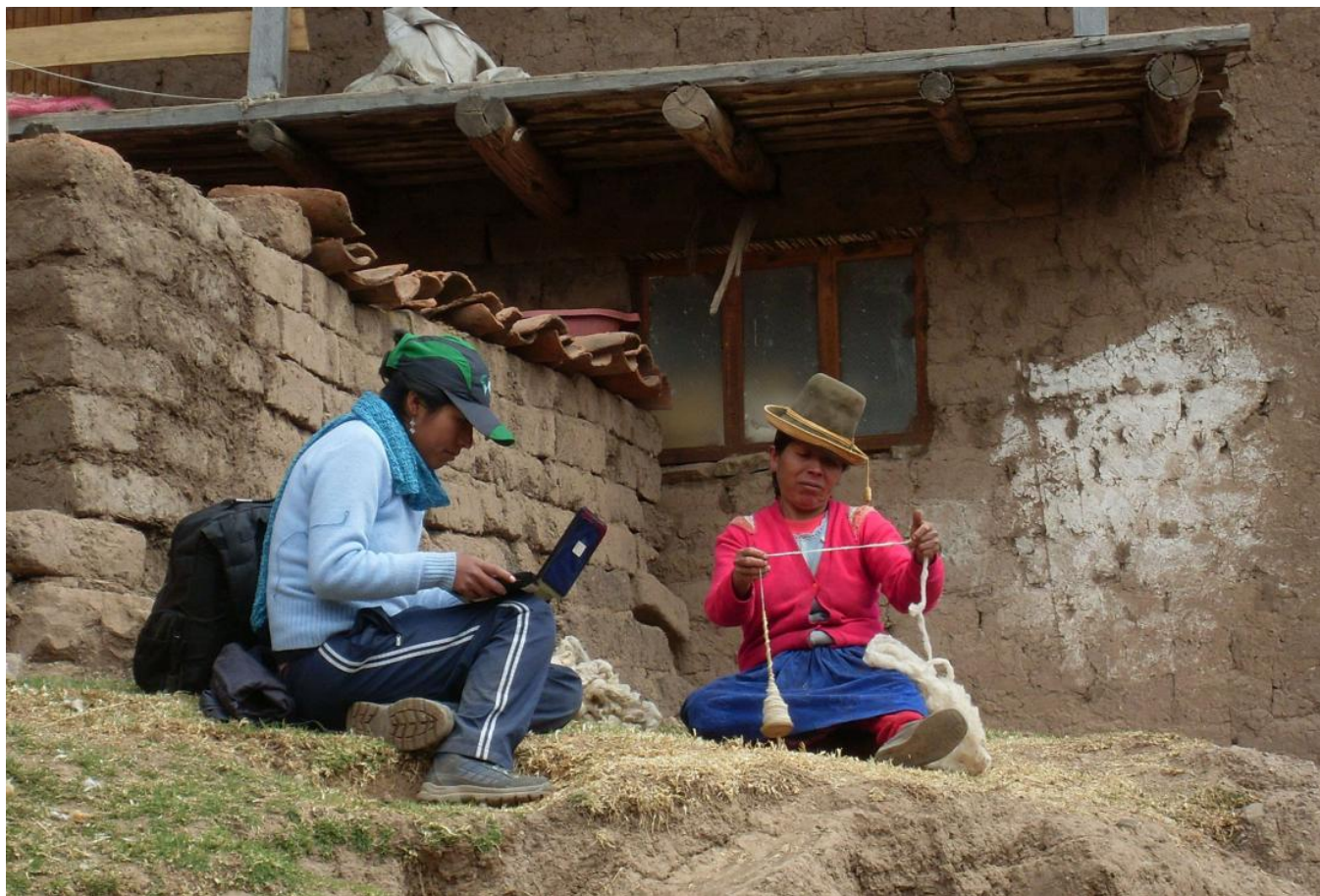
Beneficiary of graduation program answers surveyor's questions in Peru.

Most families in the study sample raised livestock and worked in subsistence farming, growing a wide range of different crops, such as potatoes, fava beans, wheat, barley, and in some warmer areas, maize. To diversify and complement their income, some members of households migrated seasonally to work on large plantations or in gold mining.