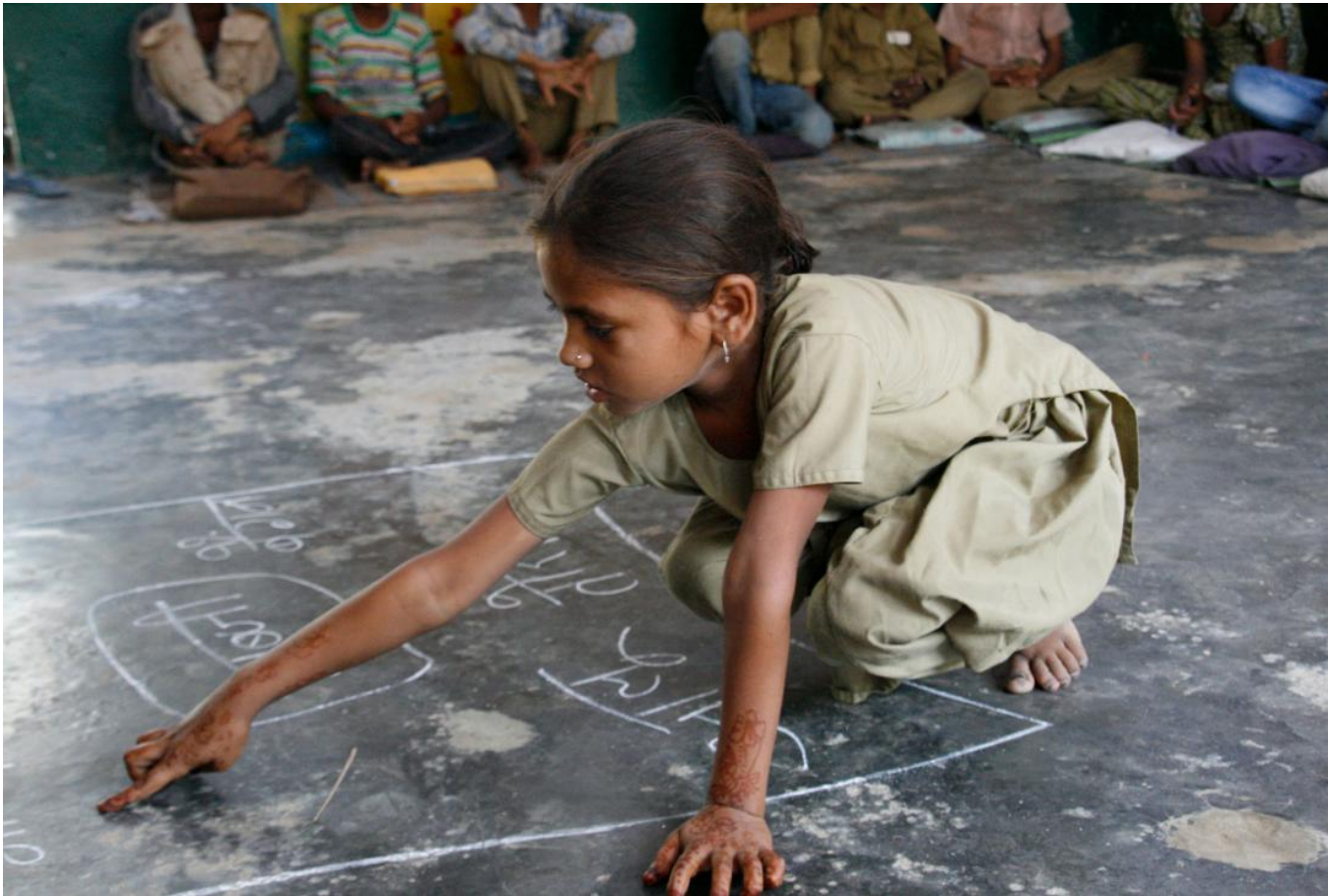
A girl in India engages in a learning activity.

Education Report (ASER), which involves a short educational test administered to a large and representative sample of rural children in India. The report has shown large deficits in basic reading and math capabilities. For example, according to ASER 2008, 45 percent of children in standards three to five cannot do subtraction and 33 percent cannot read a standard one text. There have been a variety of responses to this problem. The Central government began a major initiative, the Sarva Shiksha Abhiyan (SSA), in 2001 to provide additional resources and support to state-level education systems to push for universal elementary education by 2010. Complementing this push, Pratham has been developing new reading materials and teaching methods that are designed to be more accessible and effective in current conditions in India's education system. These methods lie at the center of its nation-wide effort, Read India, whose objective is to teach children basic reading and math skills, thus improving learning levels.