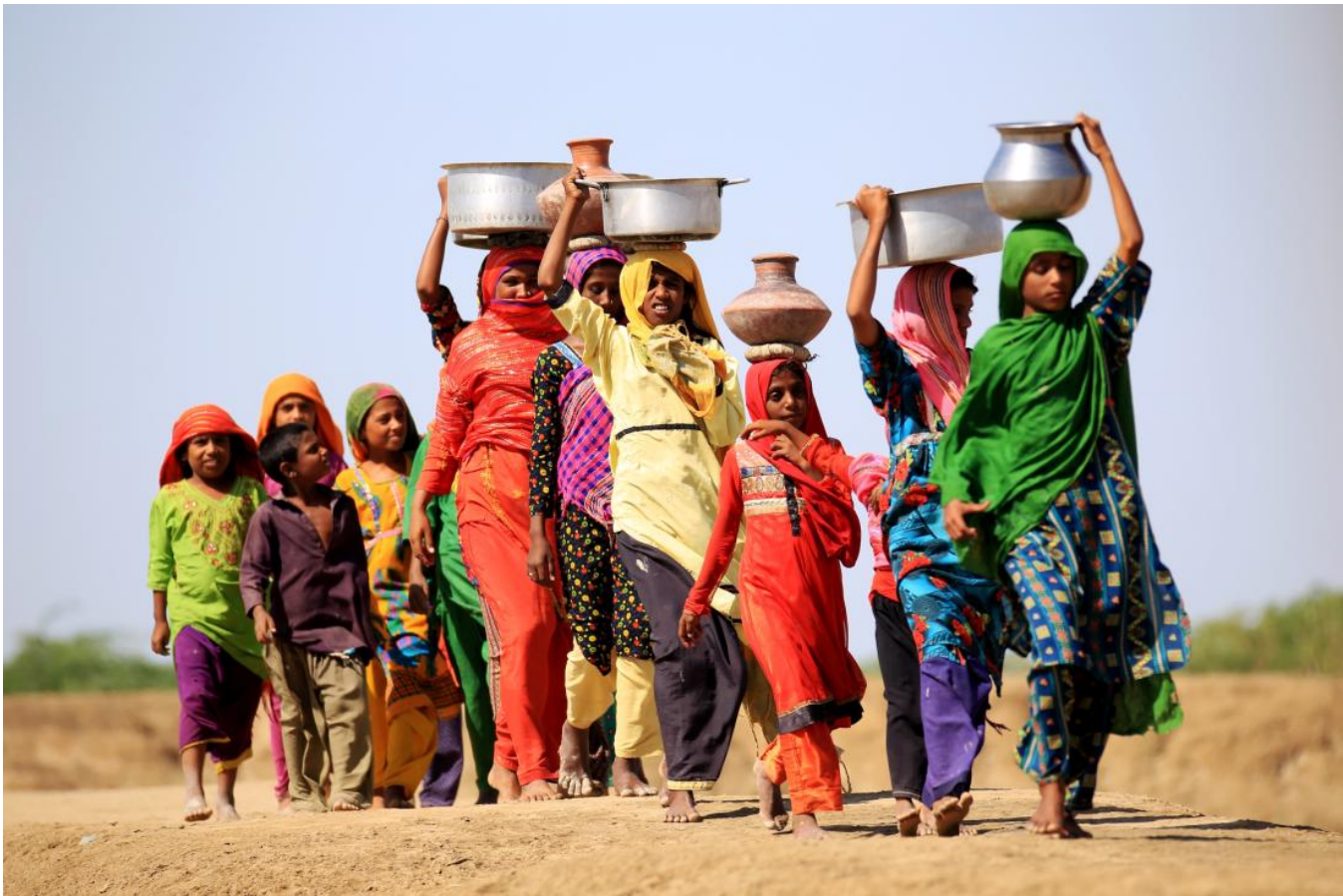
Women carrying water containers in Pakistan

This study took place in the Coastal Sindh region of Pakistan. To implement the Graduation program, researchers partnered with Aga Khan Planning and Building Services Pakistan, Badin Rural Development Society, Indus Earth Trust, and Sindh Agricultural and Forestry Workers Coordinating Organization, who jointly implemented the Graduation program under the leadership and funding of Pakistan Poverty Alleviation Fund. To select the poorest members of the communities, the project team conducted a Participatory Wealth Ranking, in which villagers collectively ranked households according to their wealth during a community meeting. The ranking process was followed by a short survey to verify the results.