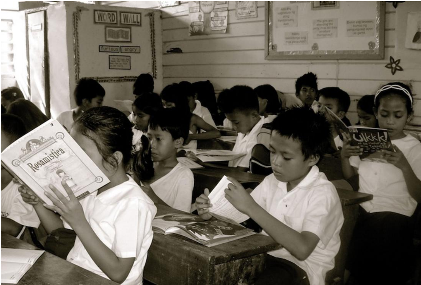
Young readers in a classroom in the Philippines