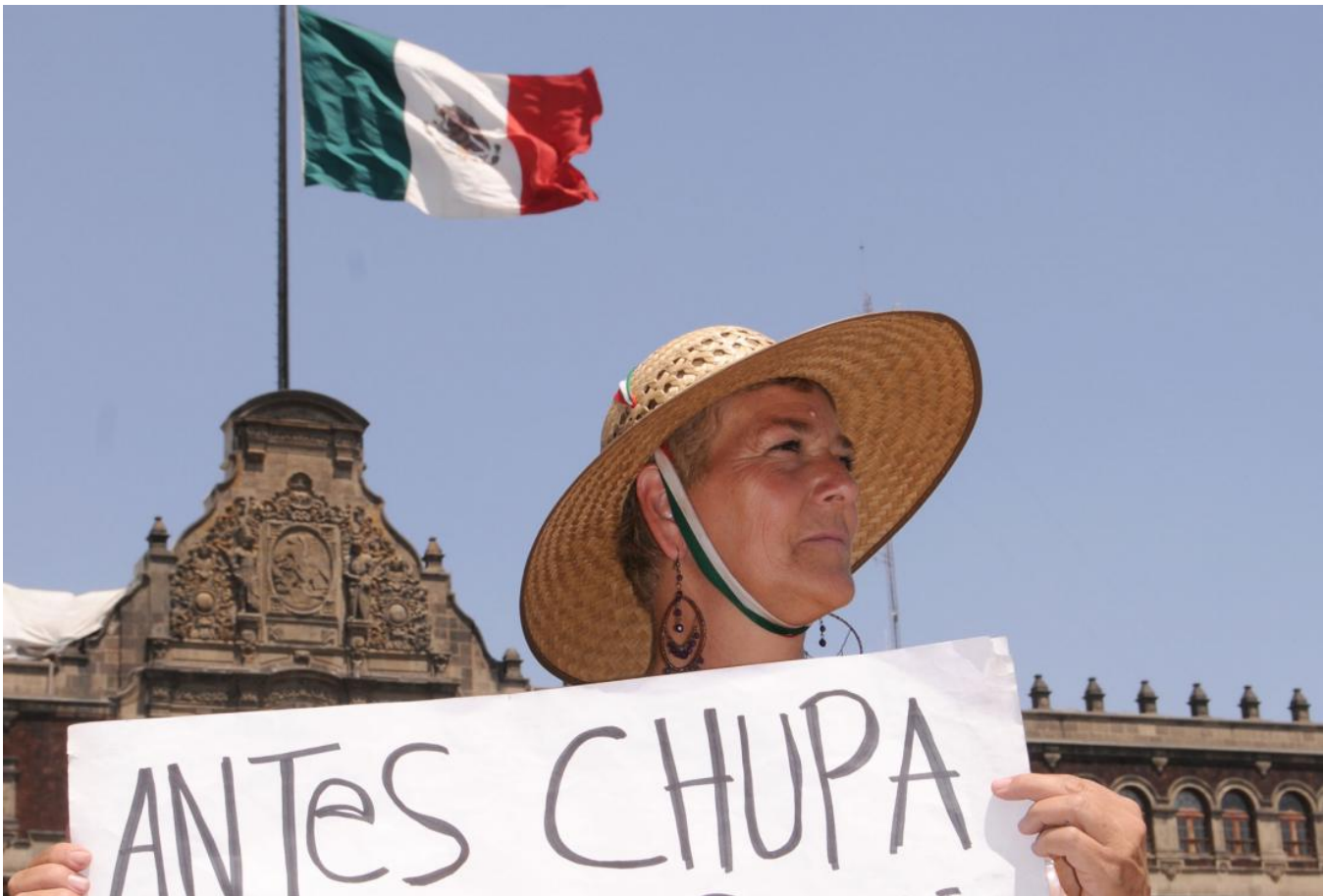
Man protests in Mexico

Further impeding voters' ability to hold mayors accountable are widespread misconceptions about which public works and services municipal authorities are responsible for providing, as well as a lack of available information about the amount of money municipalities receive and how this money is spent. In an attempt to ensure greater municipal accountability, a 1999 constitutional reform established the Federal Auditor's Office (ASF). On a yearly basis, the ASF selects a sample of municipalities in each state to audit. The results of the audits are published in lengthy reports, which are made available online. Though public, these reports are rarely used by media or political parties in local campaigns because the release date of the reports is not aligned with the timing of elections.