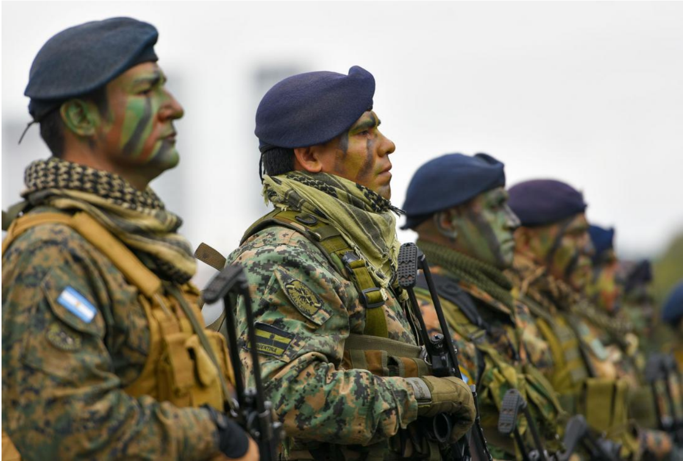
Military officers in Argentina.

Evidence from the World Health Organization shows that Argentina has historically been classified as a relatively peaceful society and maintained homicide rates below those of neighboring countries such as Brazil and Mexico. Research indicates that income inequality, low growth rates of GDP, low police per capita ratios, and drug-related illicit activities are key "causes" contributing to violent crimes in Argentina. 1