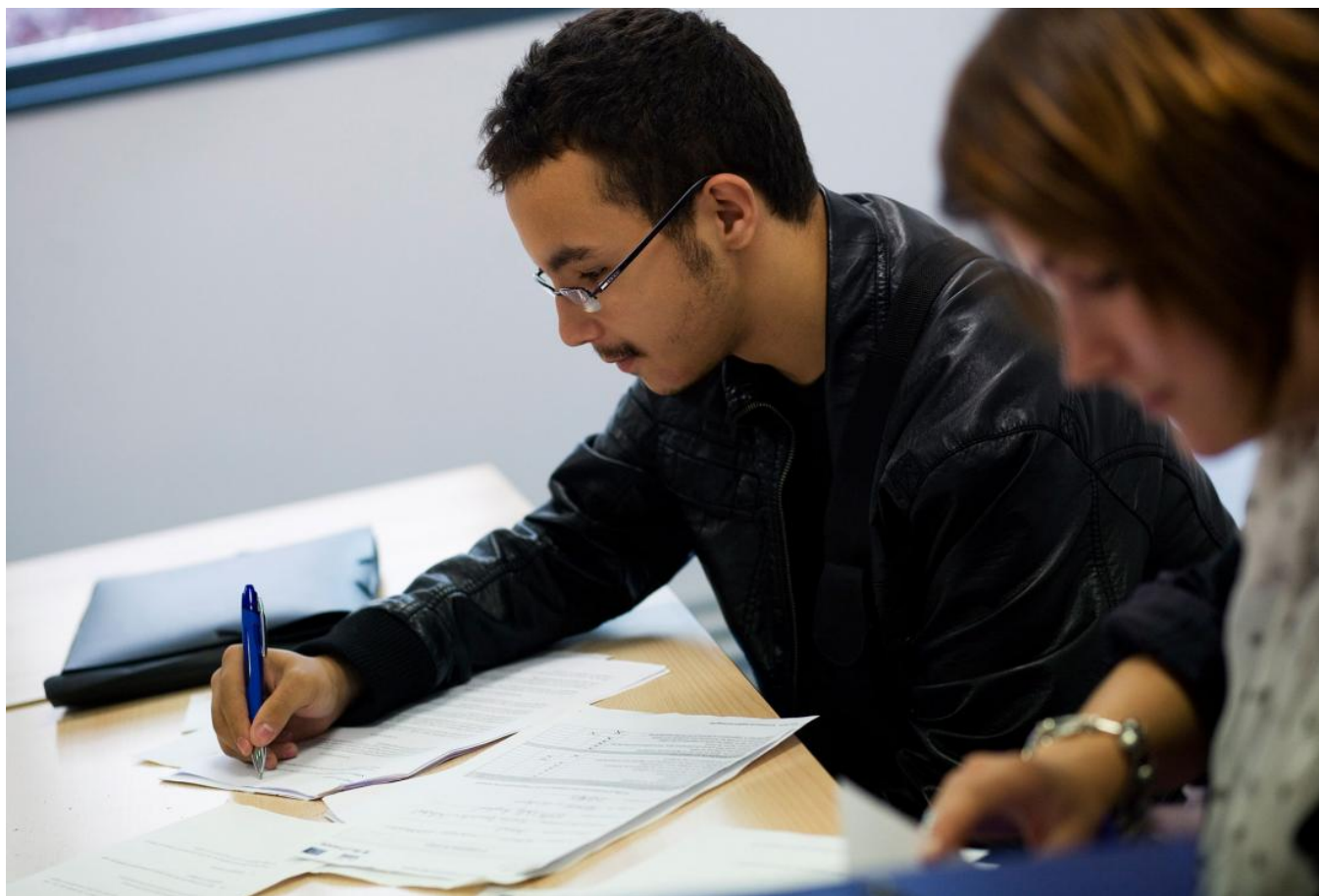
French man working on his CV

minorities, then resumes containing candidate names and addresses may offer a way for them to identify such applicants. In an attempt to combat this discrimination, France passed a law in 2006 that mandated the removal of candidate names and addresses from all application materials submitted for jobs, making them anonymous. However the law was never enforced. Instead, in 2009 the government decided to launch a program where firms could choose to accept only anonymous resumes during hiring processes managed through the public employment service, Pôle Emploi.