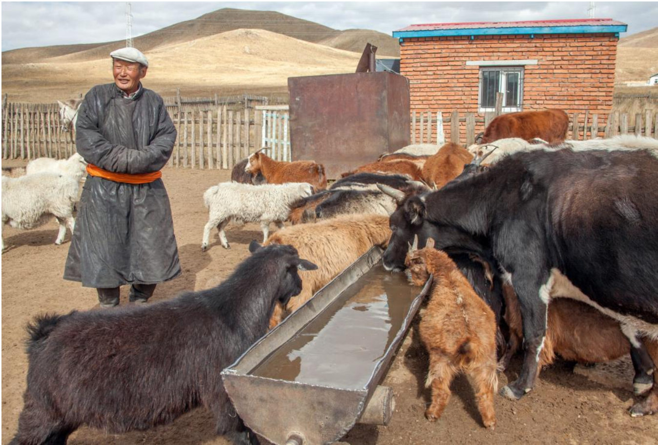
Herder and livestock, Mongolia.

richer, male, and urban Mongolians. MFIs are therefore looking for more cost-efficient ways to serve poor, rural borrowers. Mongolian microcredit has traditionally been provided in the form of individual loans. In the past, many MFIs assumed that nomadic indigenous Mongolians would not take up group loans because they had small social networks outside their extended families. But in recent years, informal collective self-help groups have developed in rural areas across the country and have begun to offer loans to their members, suggesting that group lending may be feasible in Mongolia.