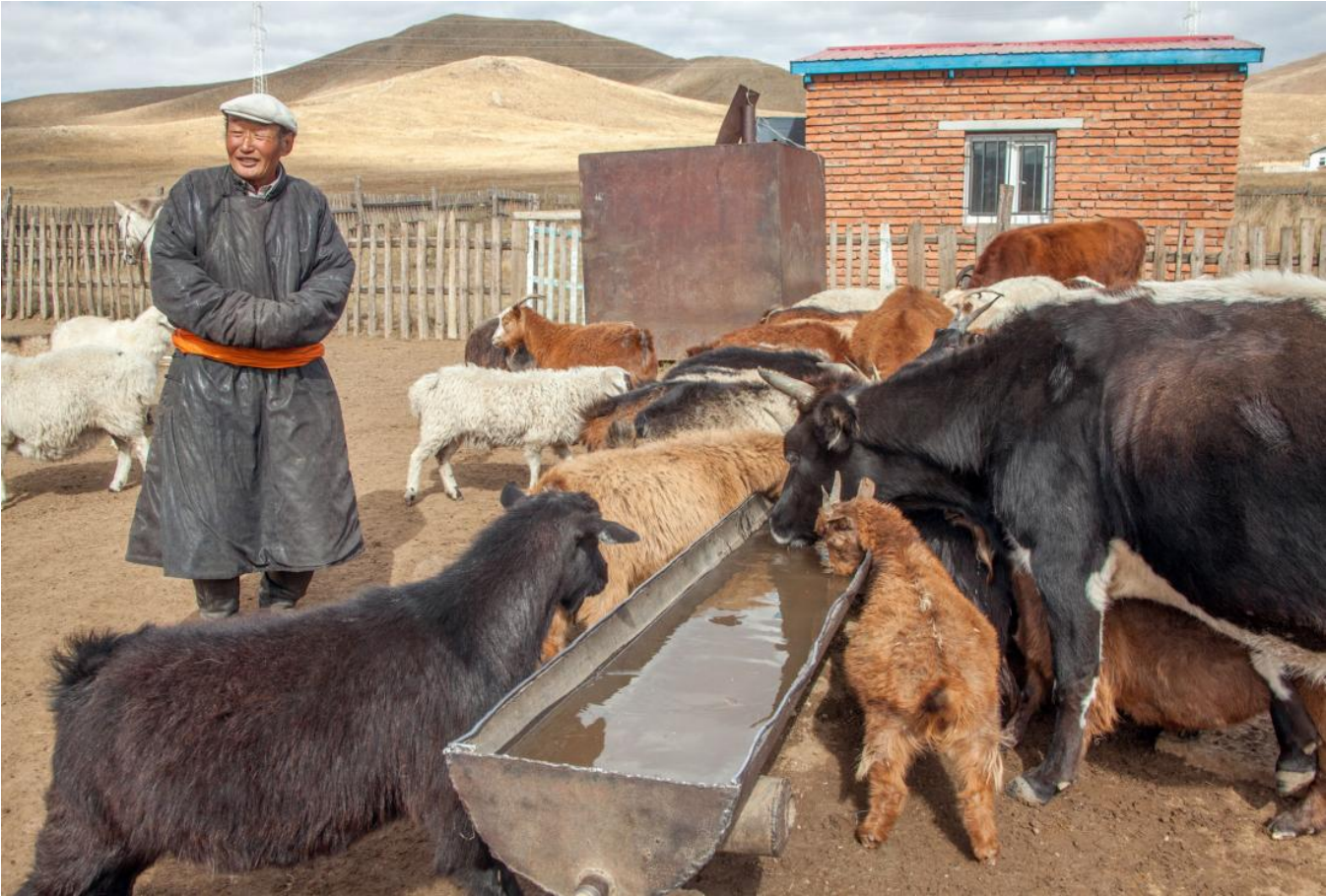
Herder and livestock, Mongolia.

richer, male, and urban Mongolians. MFIs are therefore looking for more cost-efficient ways to serve poor, rural borrowers. Mongolian microcredit has traditionally been provided in the form of individual loans. In the past, many MFIs assumed that nomadic indigenous Mongolians would not take up group loans because they had small social networks outside their extended families. But in recent years, informal collective self-help groups have developed in rural areas across the country and have begun to offer loans to their members, suggesting that group lending may be feasible in Mongolia.