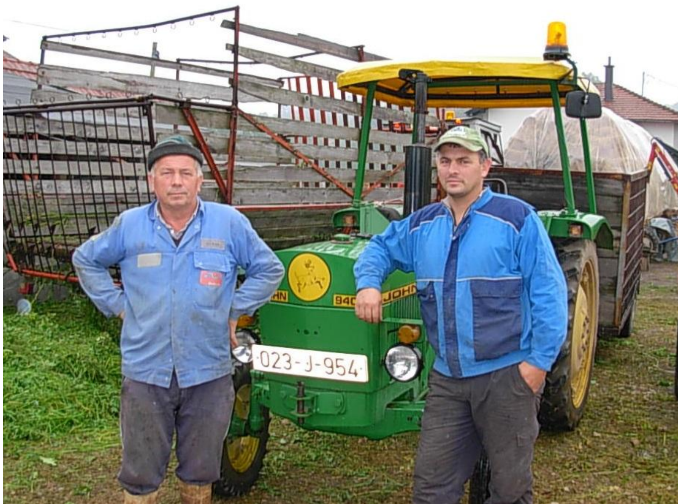
Microloan borrowers with their tractor in Bosnia and Herzegovina

Bosnia and Herzegovina has an active microcredit market, but poorer segments of the population have typically not been served by MFIs. Prior to this study, the microfinance applicants who participated earned an average annual income of about US$11,100. On average, around 40 percent of their annual income came from self-employment. Nearly one third of the applicants had only completed primary school, while 5 percent had attended university. The study took place at the height of the global financial crisis of 2008 and 2009, which strongly affected Bosnia and Herzegovina. During the study, many MFIs experienced dramatic increases in late and non-repayment.