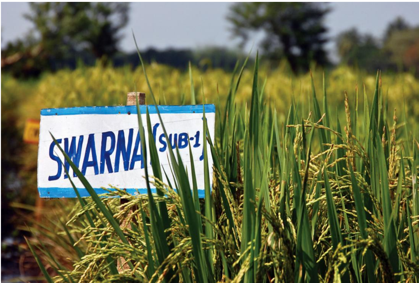
A field of Swarna Sub1 rice growing in India.

This project evaluates the impact of introducing the Swarna-Sub1 rice variety in the Indian state of Odisha. In this region, rice is a staple food and risk of flooding is high. Low levels of fertilizer use are characteristic of flood-prone areas of India.