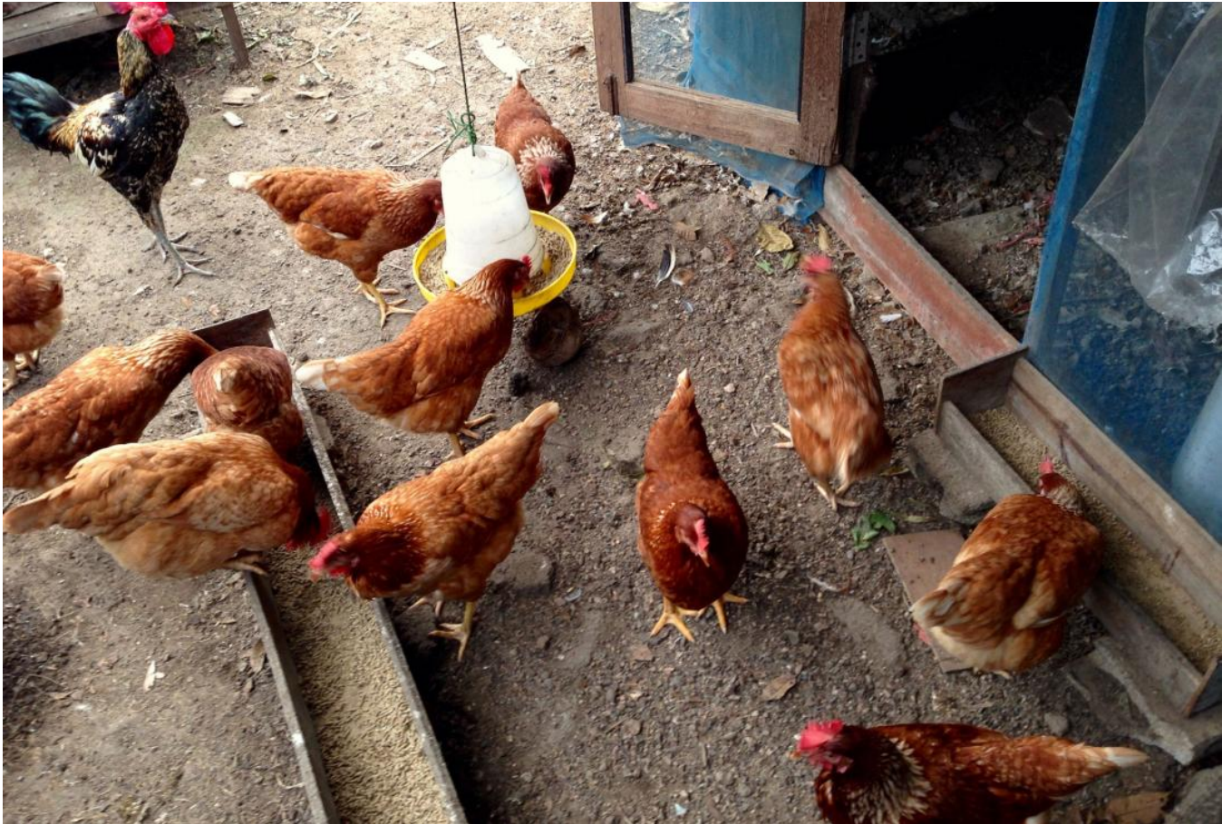
Many beneficiaries chose to receive chickens, however, illness caused many chickens to die by the end of the program.

In Honduras, researchers partnered with PLAN International Honduras and Organización de Desarrollo Empresarial Feminino Social (ODEF), a local microfinance institution. The study focused on in-income households with children who were not generally receiving microcredit or development assistance. Those ultimately selected to participate were identified as the least financially well-off members of the community through a participatory wealth ranking process. Within the sample, the median daily per capita consumption was US$1.32 in 2014, with 60 percent of households consuming less than US$1.25 per person per day. At the start of the study, around 40 percent of households reported that some adults sometimes had to skip meals, and 20 percent reported the same for children.