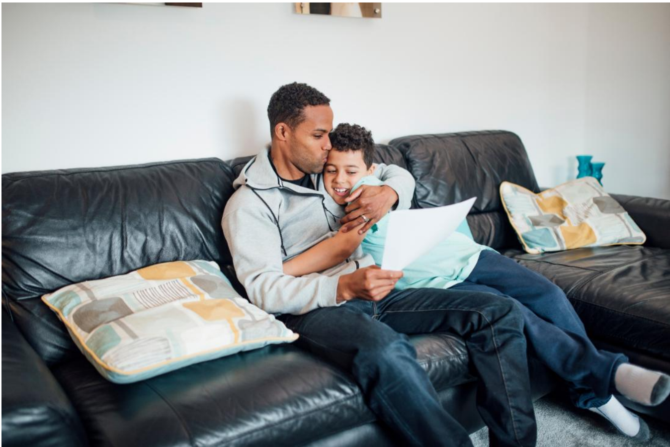
Father hugs son while looking at his report card.

According to results of the baseline survey for this study, 65 percent of parents stated that they did not know their child's academic performance from the last report card. The reasons that parents most commonly cited for this were that (a) they were unable to read or understand the report; or (b) they did not receive the report in the first place.