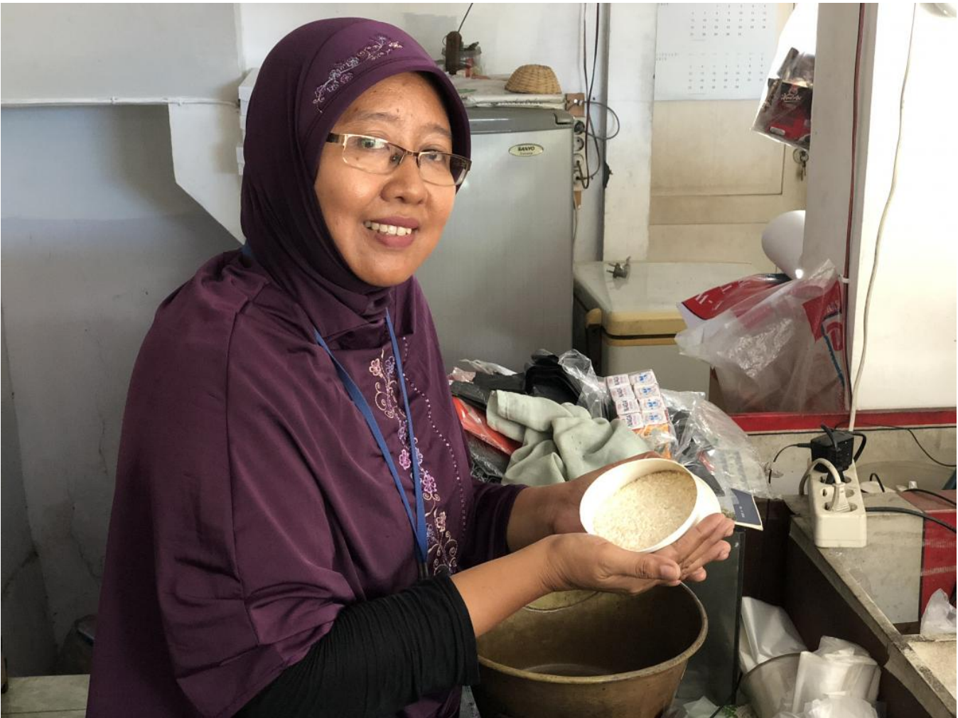
A local rice agent for the Non-Cash Food Assistance (BPNT) program holds a bowl of rice in East Java, Indonesia.