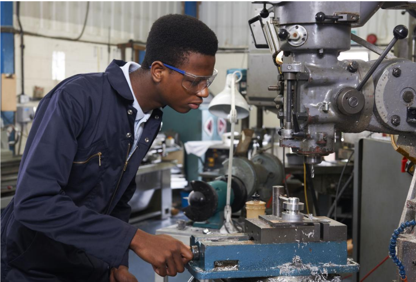
Man working in factory