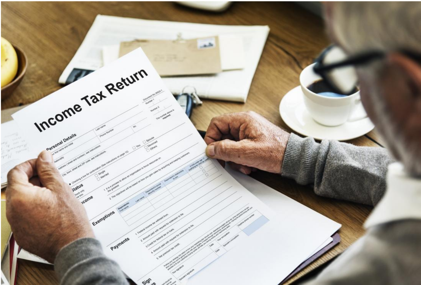
Person looks at tax document in the United States