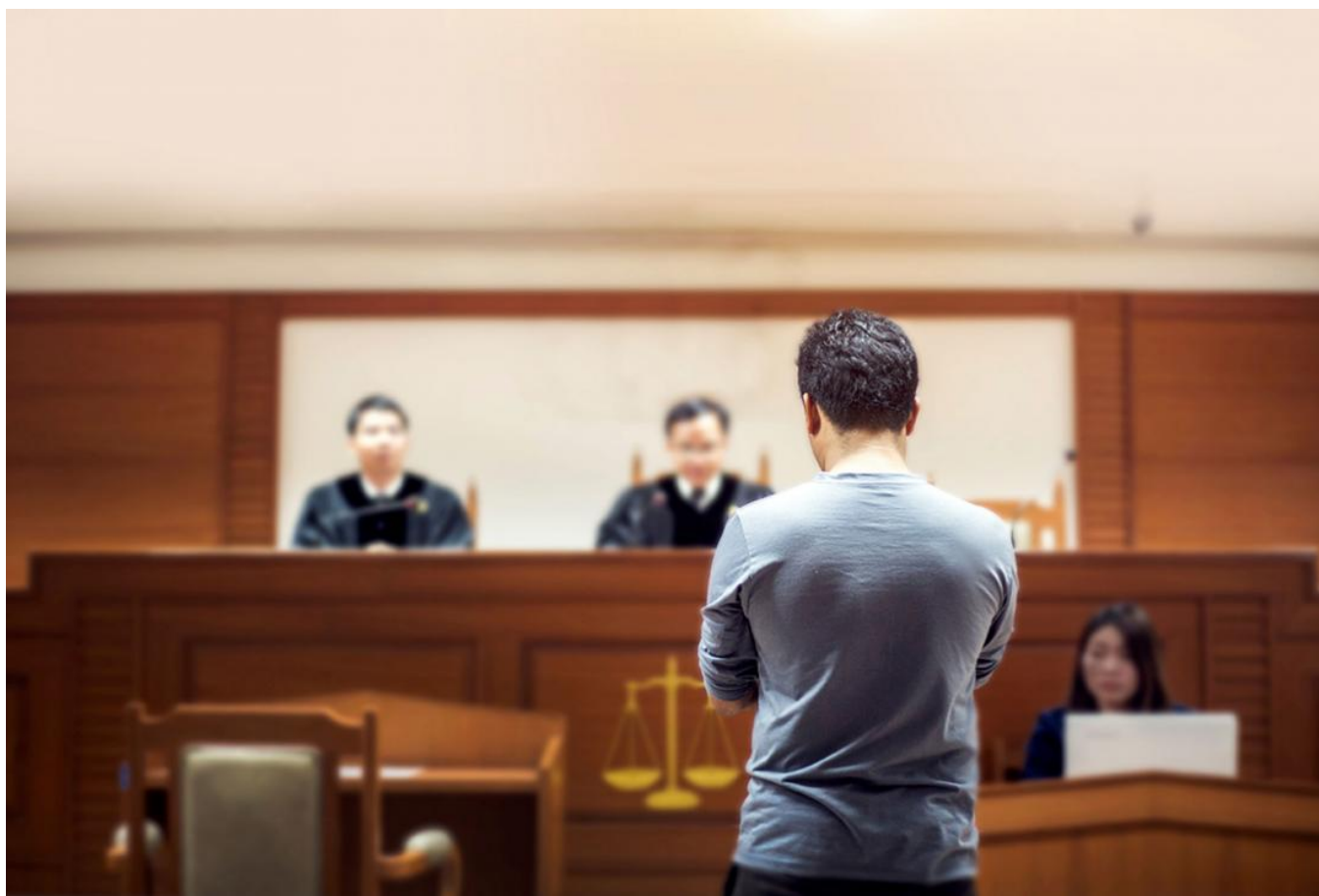
Man stands before judge in a courtroom.

Behaviorally informed alterations to the summons form and pre/post court date text messages were rolled out to individuals who received summonses in NYC starting in March 2016. Anyone in New York City receiving a summons is given the option to provide their cell phone number to police, and approximately 13 percent do. Roughly 20,000 summons recipients who provided a cell phone number between March 2016 and June 2016 were included in a randomized evaluation to test the effect of text messages on FTA.