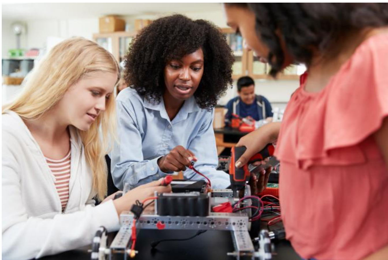
Three college students work together on a project in the United States

Six-month online program: The online version of the program offered a six-month engagement in STEM enrichment activities, with online speakers and interactions, and a short “conference” visit to the HI campus over the summer. About 150–175 students participate in the online program.