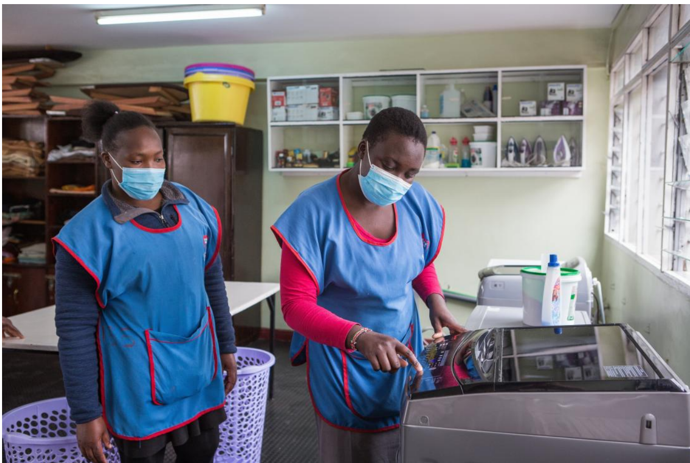
Domestic workers wearing surgical masks attend a training in Kenya.

Different actors have been investing in mask distribution programs to respond to low rates of mask adoption. The NGO SafeHands Kenya, for instance, distributes masks to vulnerable communities around the country, including Siaya county, with similar campaigns underway in neighboring Uganda. Building on this work, the Ministry of Health in Siaya County was interested in identifying the key barriers to mask adoption, and determine the most cost-effective ways to encourage people to wear masks regularly, including through mask distribution.