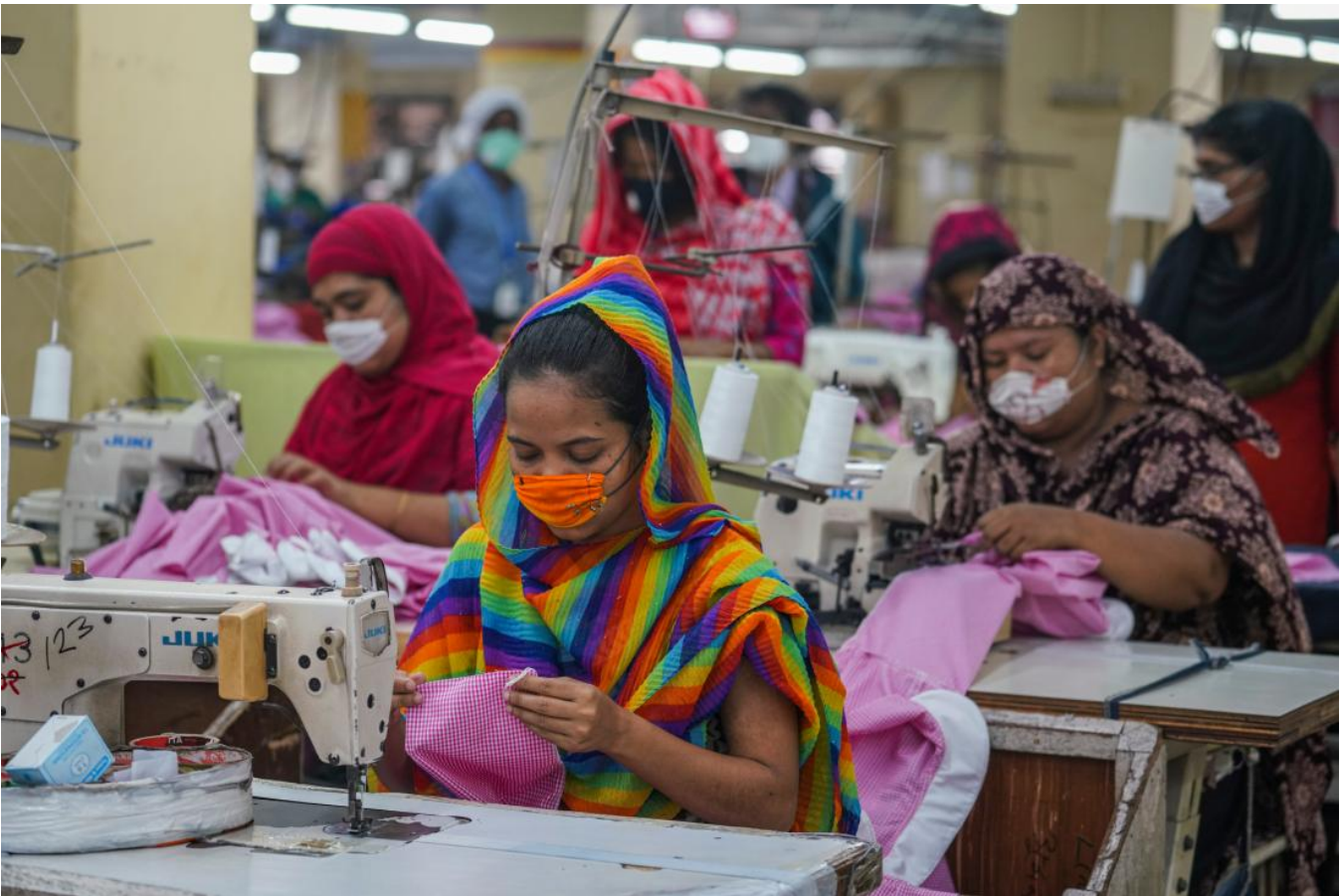
Factory workers wearing surgical masks sew garments in Bangladesh.