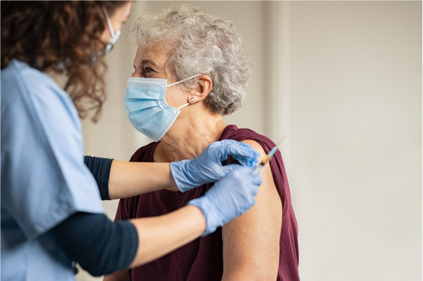
A nurse vaccinates an older woman in the United States