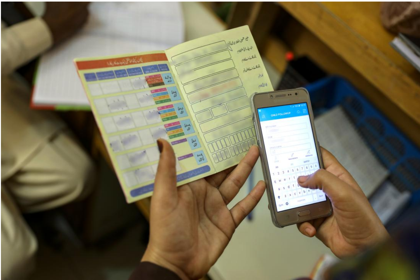
A health worker enters data from an Expanded Programme on Immunization (EPI) card into the Government of Sindh's electronic immunization registry in Pakistan.

As of 2017 to 2018, full immunization coverage (FIC) for children aged 12 to 23 months in Pakistan was 66 percent. In the Sindh province, FIC rates were below the national average at 48.8 percent. Korangi town, where this evaluation took place, is in Sindh’s Karachi city and home to an ethnically diverse population of over one million. Children in Korangi are vaccinated at fixed immunization clinics or during outreach by vaccinators. Before the intervention, 61.8 percent of children in Korangi had received BCG (Bacille Calmette Guérin), the first vaccine in a child’s schedule, compared to 88 percent of children across Pakistan.