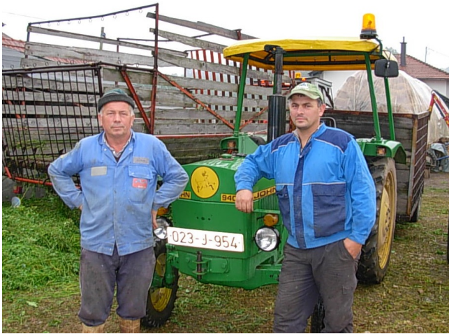
Microloan borrowers with their tractor in Bosnia and Herzegovina