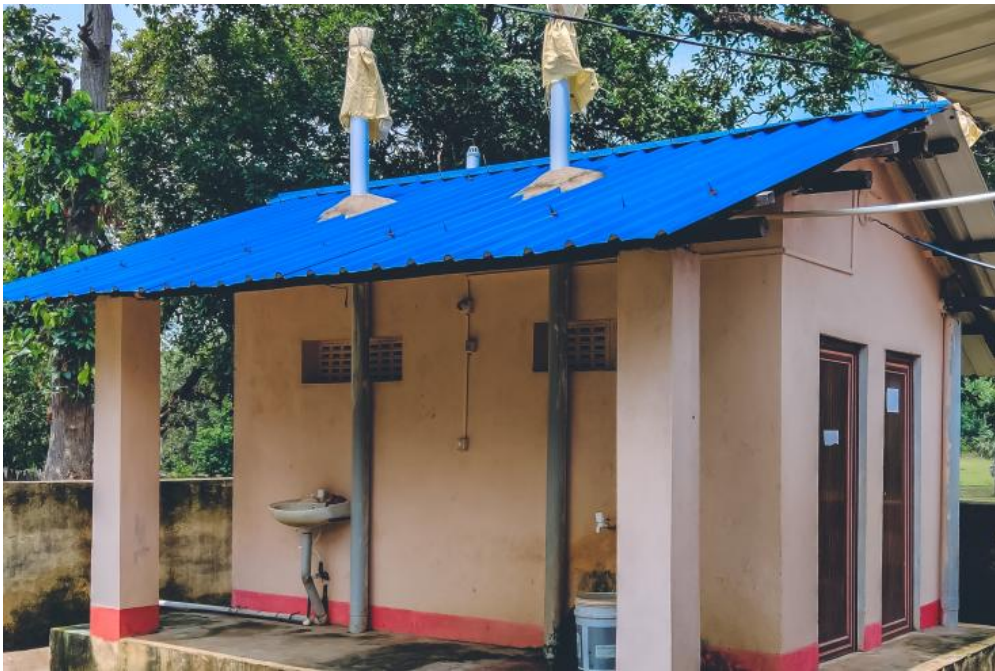
Community toilet in India.

Programs involving community behavior-change campaigns and subsidies to boost toilet construction can improve people's access to and use of improved sanitation facilities. However, evidence on the downstream health impacts of common sanitation programs in low- and middle-income countries has been mixed.