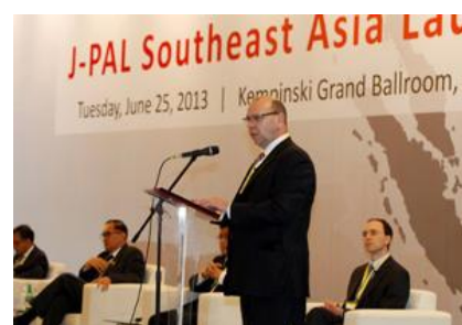
AusAID's Director General speaking at the launch of J-PAL's South East Asia office in Jakarta.