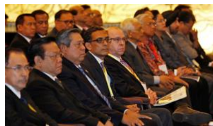
The President of Indonesia, His Excellency Dr Susilo Bambang Yudhoyono, attended the launch of J-PAL.