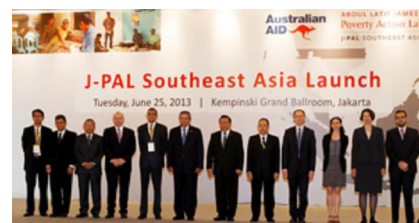
High level attendees and speakers at the launch of J-PAL's office in Jakarta.