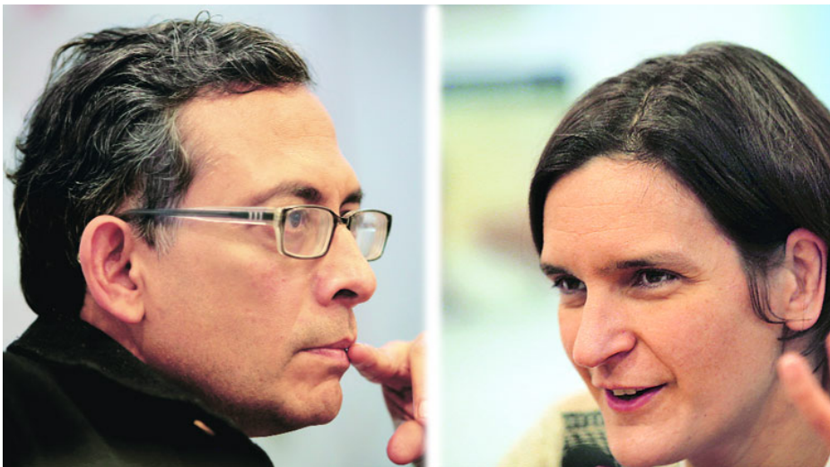
MIT economists Abhijit Banerjee and Esther Duflo at The Idea Exchange.