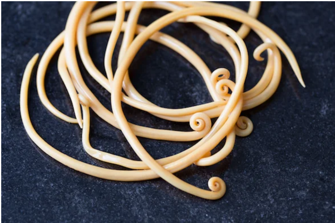
The parasitic roundworm Ascaris lumbricoides .

By Ellen Agler with Mojie Crigler on January 29, 2019