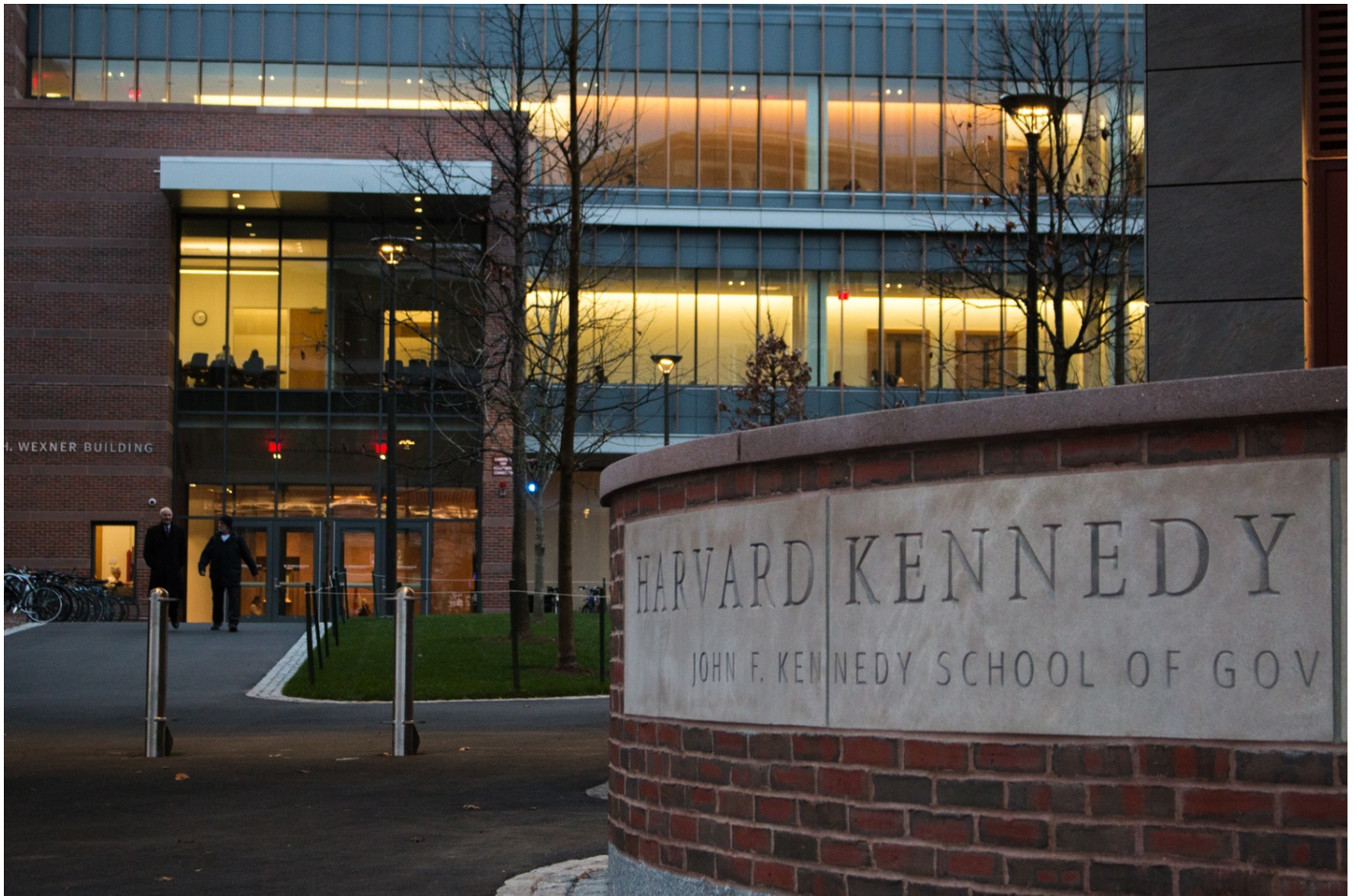
The Harvard Kennedy School, pictured in 2017.