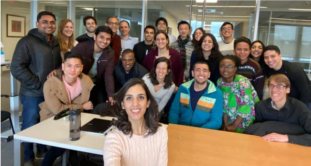
The first cohort of DEDP master's students stand with J-PAL and DEDP faculty directors Abhijit Banerjee, Esther Duflo, and Benjamin Olken in early 2020 at MIT.