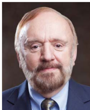
UC Berkeley chemistry professor wins prestigious Japan Prize