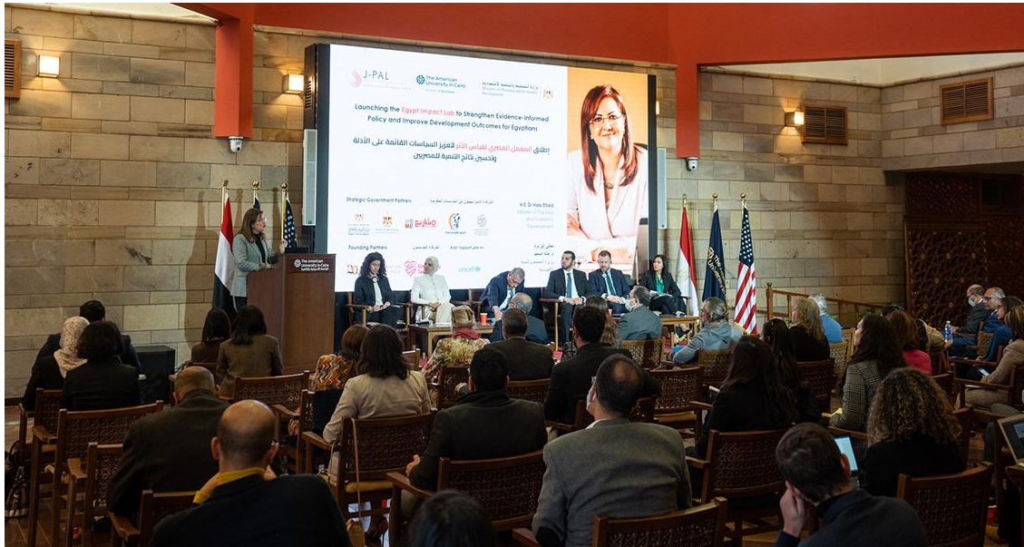
Launch of the Egypt Impact Lab.