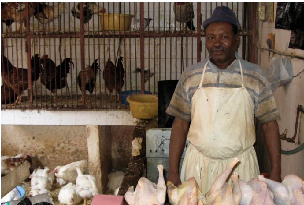
A poultry vendor in South Africa.

Demand for many of the microcredit products was modest. People often used funds for consumption rather than entrepreneurial investments, suggesting that there were high non-entrepreneurial returns to credit. Innovations to target high-potential entrepreneurs and offer more flexible lending products may lead to more high-return entrepreneurial investments.