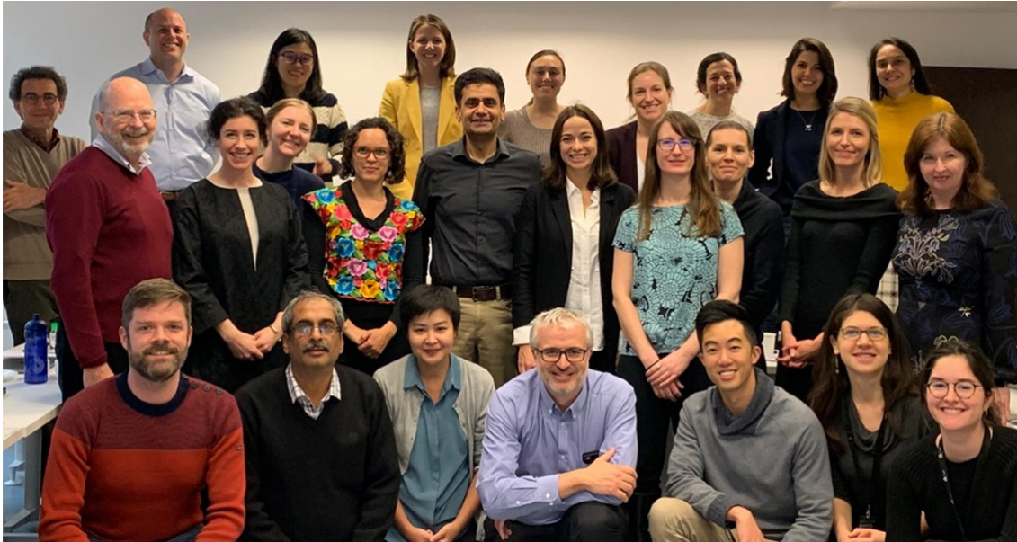
J-PAL's Senior Management Team gathered in Paris in February 2020.