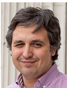
Pedro Carneiro University College London