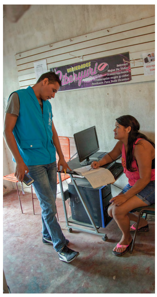
LOCATION: COLOMBIA.