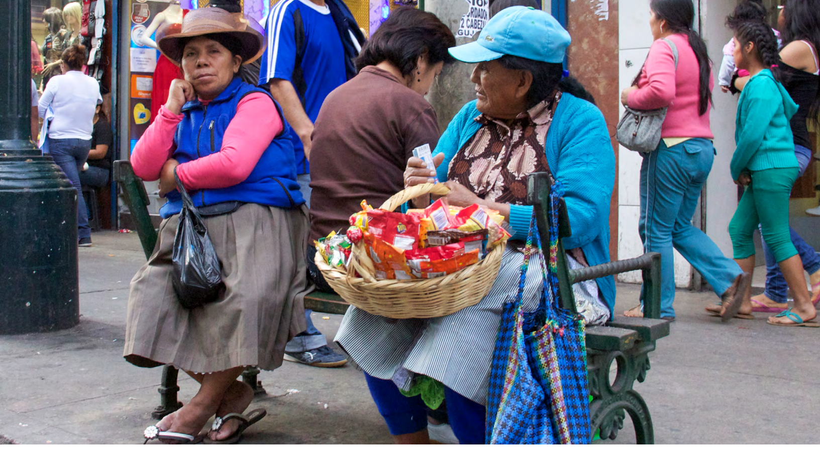
LOCATION: PERU. PHOTO: DARIO RODRIGUEZ | J-PAL/IPA