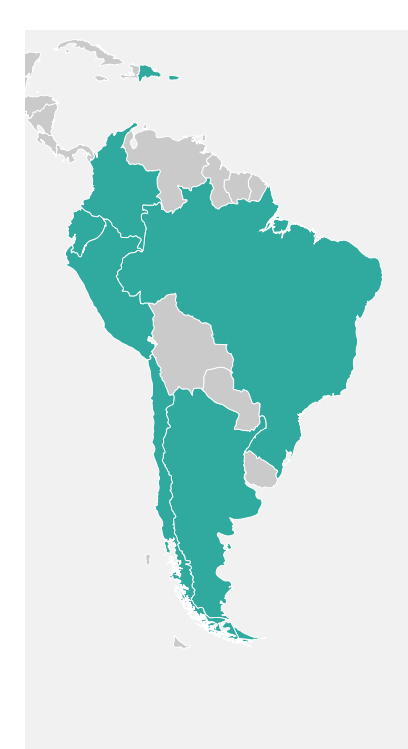
FIGURE 2. CURRENT AND PAST GOVERNMENT PARTNERS IN LATIN AMERICA AND THE CARIBBEAN