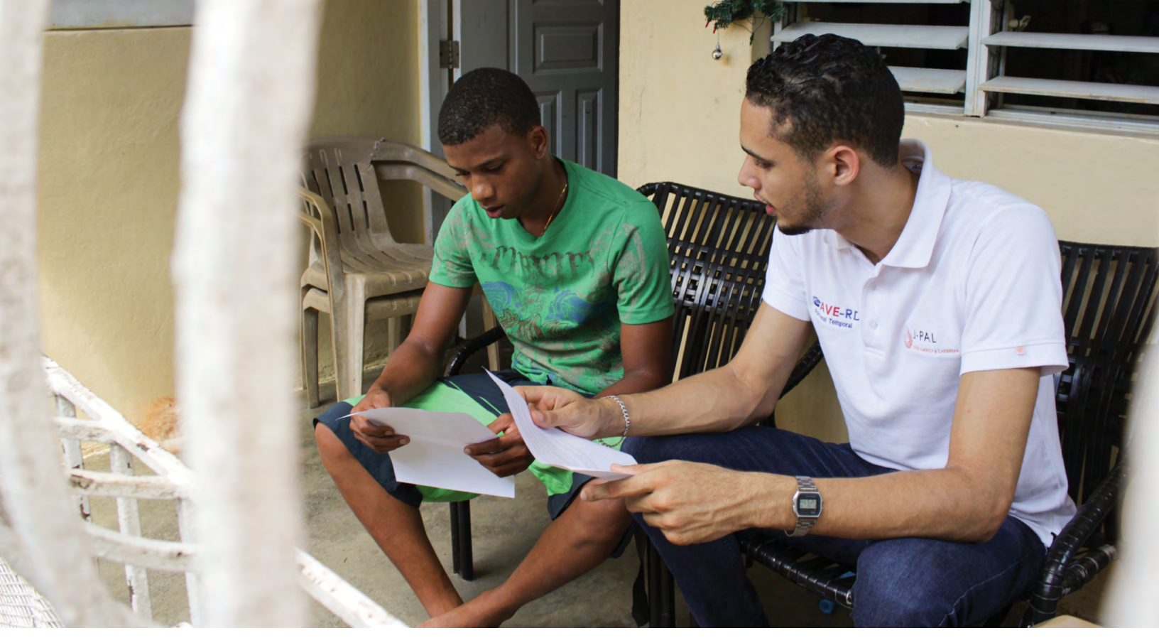
LOCATION: DOMINICAN REPUBLIC.