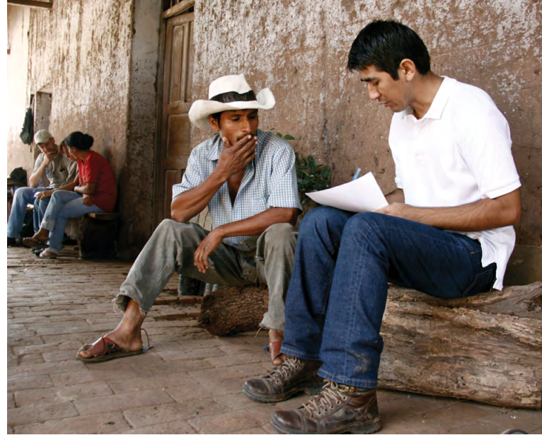
LOCATION: BOLIVIA.

Policy windows are generally open for a limited time, and when possible, we design Evidence to Policy Partnerships to generate results in time to inform a key policy or budget decision. Timing an evaluation to a policy window is often easier when the intervention period is short, and outcomes can be measured in the short-run (i.e. under a year). Of course, it is also critical to measure the impact of larger reforms or new flagship programs, as well as long-run outcomes that can give a fuller picture of a program's impact.