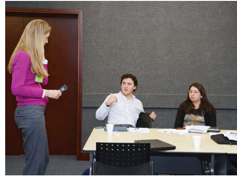
LOCATION: PERU.

• The partner institution directly designs and implements programs or has leverage over institutions that do: In our experience, it has been easier to achieve greater data and evidence use with sector-specific, implementing institutions like a Ministry of Education. Working with agencies that do not implement programs, like planning, evaluation, or finance departments, often involves coordination across multiple institutions (see Insight 3 on page 26). These partnerships are more likely to succeed when they have the power to inform policy design and decision-making in implementing agencies.