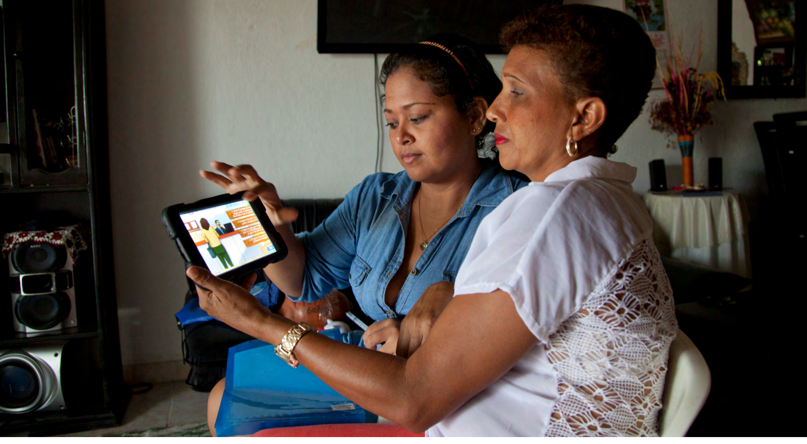
LOCATION: COLOMBIA.