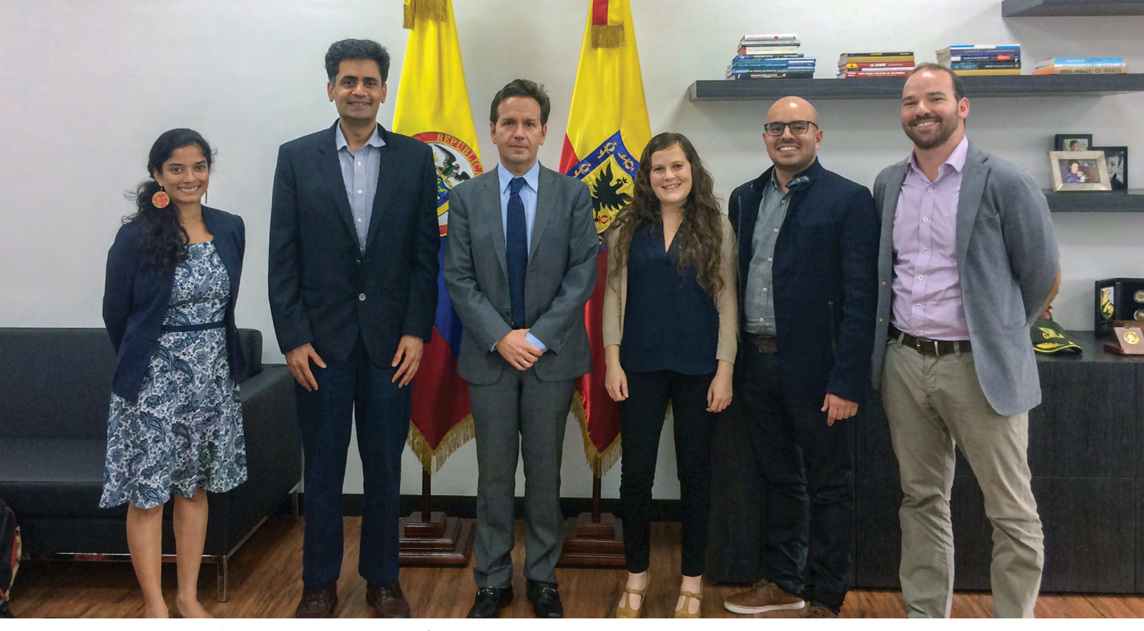
LOCATION: BOGOTÁ, COLOMBIA. IQBAL DHALIWAL, J-PAL'S EXECUTIVE DIRECTOR, AND IPA AND J-PAL STAFF MEET WITH THE DEPARTMENT OF SECURITY, COEXISTANCE, AND JUSTICE, OF THE MAYOR'S OFFICE OF BOGOTÁ.