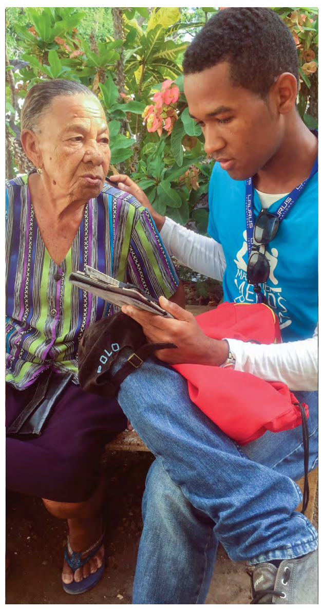
LOCATION: DOMINICAN REPUBLIC.