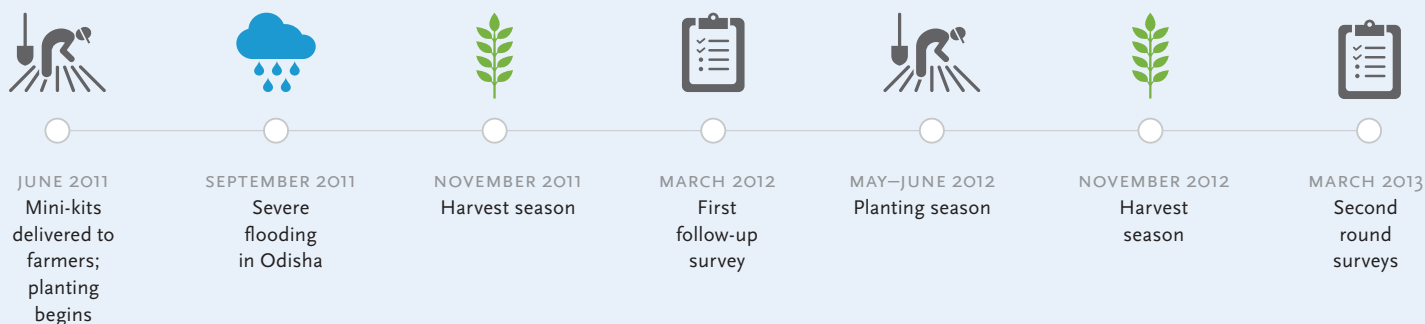
FIGURE 1. RESEARCHERS FOLLOWED FARMERS FOR TWO GROWING SEASONS