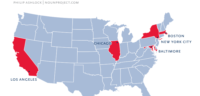
MTO FAMILIES WERE ENROLLED IN FIVE CITIES: Baltimore, Boston, Chicago, Los Angeles, and New York.

This group received special Low-Poverty Section 8 housing vouchers that initially could be used only in areas with poverty rates under 10 percent. Families also received mobility counseling. For the first year of the program, families could only use the voucher in a low-poverty neighborhood, but in following years they were able to use their voucher to relocate to any neighborhood. Voucher recipients had to comply with all Section 8 restrictions.