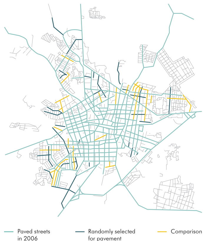
FIGURE 1. LOCATION OF STREET PAVEMENT PROJECTS IN ACAYUCAN, MEXICO

Researchers worked with the government of Acayucan to randomly select 28 of 56 potential street pavement projects. These streets were in low-income, residential areas on the outskirts of the city.