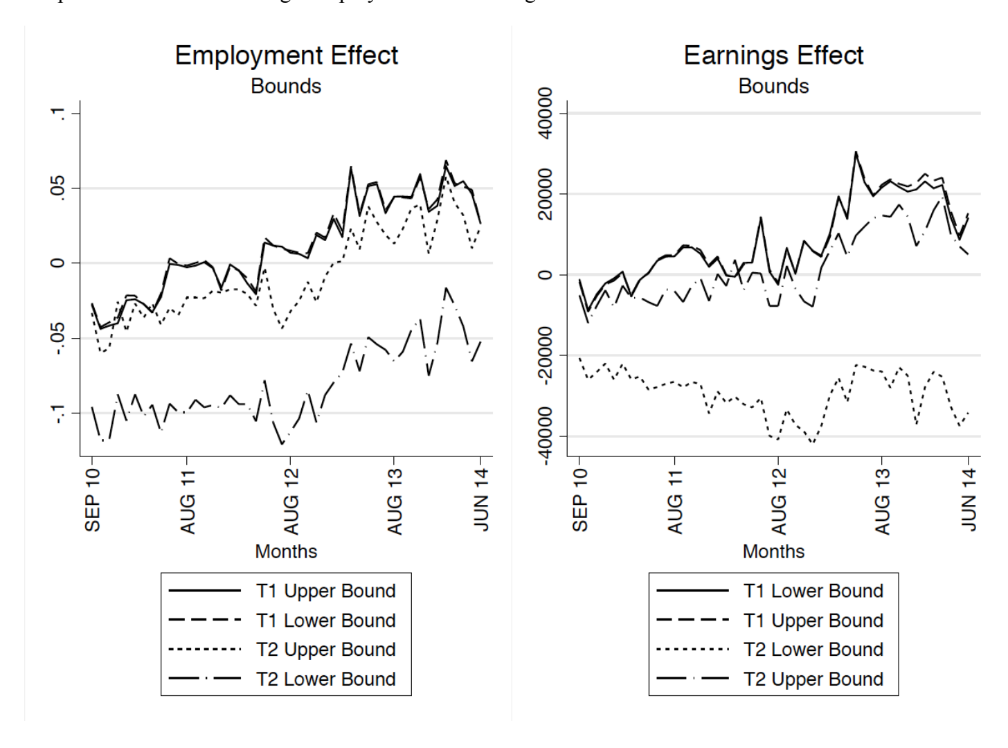
Graph 2: ITT Bounds on Wage-Employment and Earnings for MESP+

Note: Plot of the bounded effects of T1 (MESP) and T2 (MESP+) on wage-employment and earnings, for September 2010-June 2014. The lower (upper) bound for MESP+ (T2) is computed by trimming the top (bottom) 4.7% of the MESP+ data. The estimate for MESP (T1) changes due to sample change. Data from the unemployment insurance administrative records.