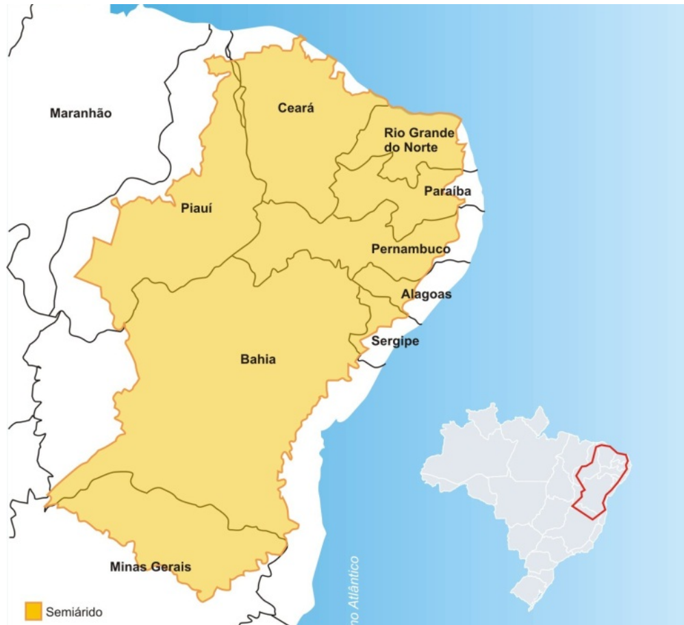
Figure 1: Brazilian semi-arid region

Notes: The Brazilian semi-arid region consists of 1,133 municipalities spread across 9 states. It is characterized by lower rainfall than the rest of the country and higher rainfall variance.