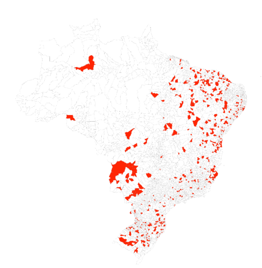
FIGURE 2: DEMAND/BELIEFS EXPERIMENT: SAMPLE MUNICIPALITIES