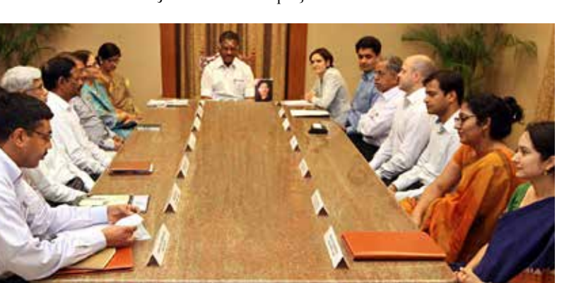
MoU signing with the Government of Tamil Nadu

First field staff training held for field staff of J-PAL South Asia projects.