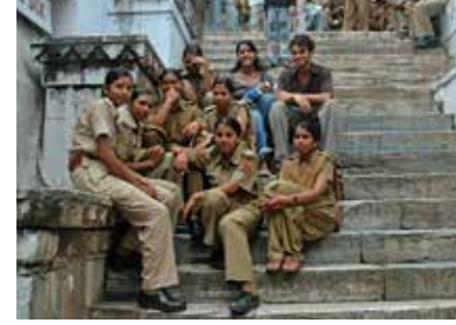
Police training improves public perception and police morale

Evaluation with Government of Gujarat on "Improving Third-Party Pollution Audits and Regulatory Compliance in India".