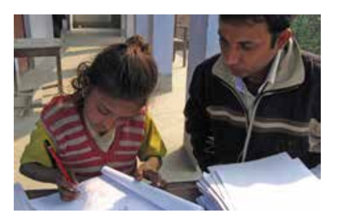
Surveyor administering the test

Delhi Voters' Project initiated to understand whether voters make informed choices when presented with performance evidence of incumbents.