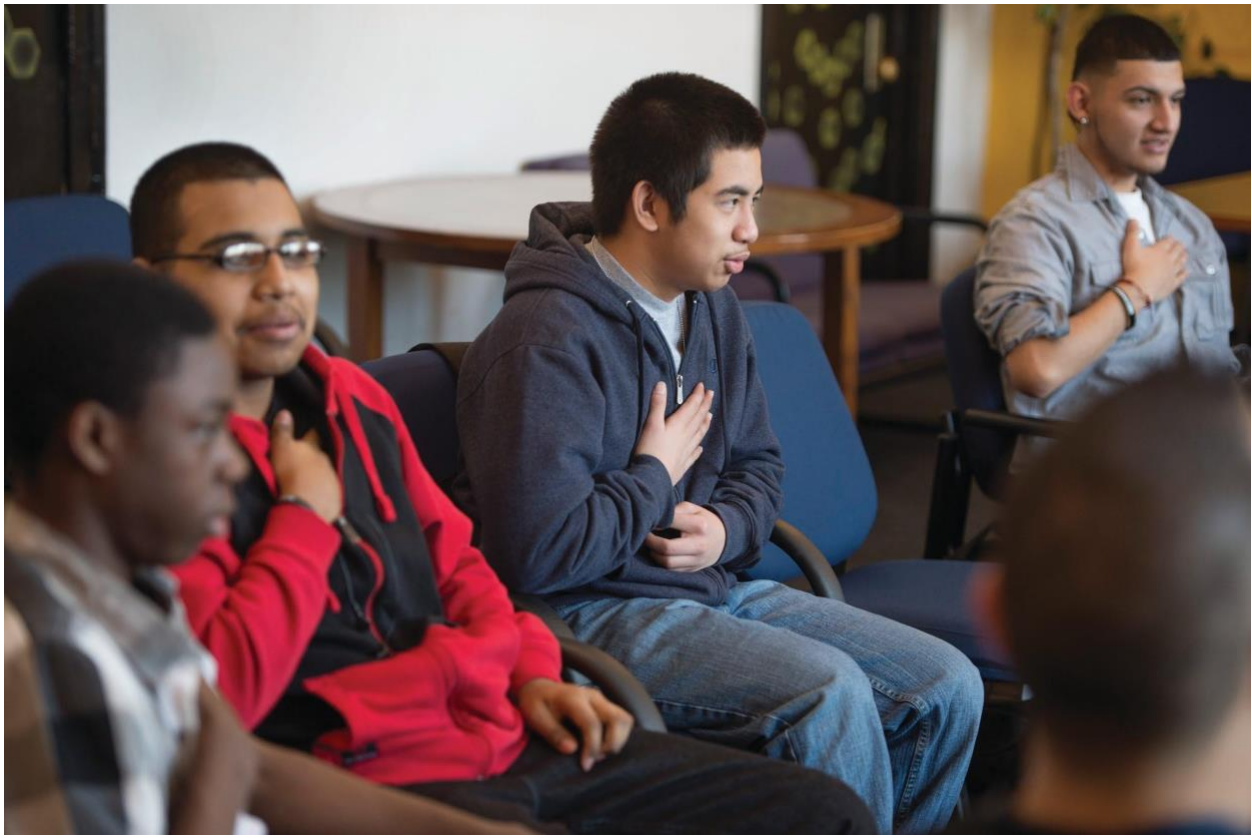
Young men participate in an activity for the Becoming a Man program in Chicago.