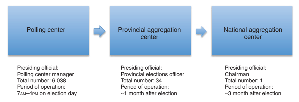
FIGURE 1. THE AGGREGATION PROCESS

count, the ballots are returned to the boxes, and the boxes are stored locally and are not transmitted to the Provincial Aggregation Center. <sup>19</sup> Changing the Declaration of Results forms is therefore all that is necessary to manipulate the aggregation process. Separate copies of each Declaration of Results form are also posted on the outside of the polling center for public viewing. One Declaration of Results form is posted for each polling substation. In the final stage, results forms are collected at the National Aggregation Center in Kabul and combined to produce a national total. Figure 1 summarizes the aggregation process.