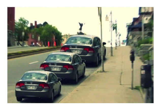
Figure 1: Three cars of identical size

the ways in which problem presentation, peers, and other Lewinian environmental pressures affect their own construal.