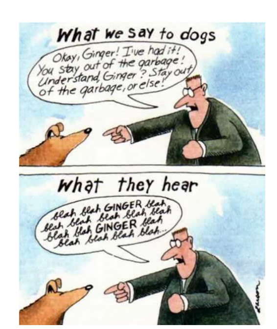
Figure 4: Investigators listening to participants. Copyright Gary Larson.

only the information we deem relevant, as participants tell us things we fail to decipher.