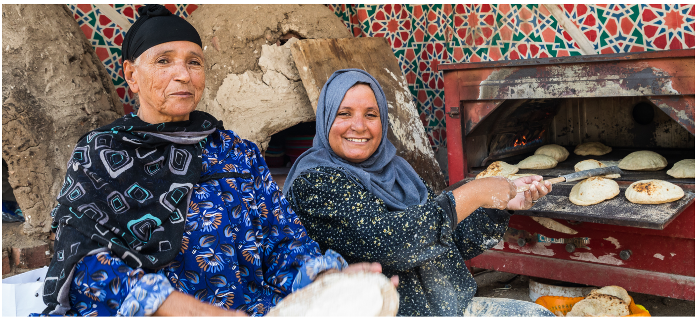
COVER PHOTO: EGYPT. @UNICEF/ASSIUT/SAHARA/AHMEDHAYMAN, PAGE 4: EGYPT. EMILY MARIE WILSON | SHUTTERSTOCK.COM

urban and rural areas.<sup>8</sup> Norms underpinning child marriage include expected girls' and women's societal roles and men's economic value relative to women, economic conditions of the family, transitions to adulthood, family reputation and honor, and religious misinterpretations.