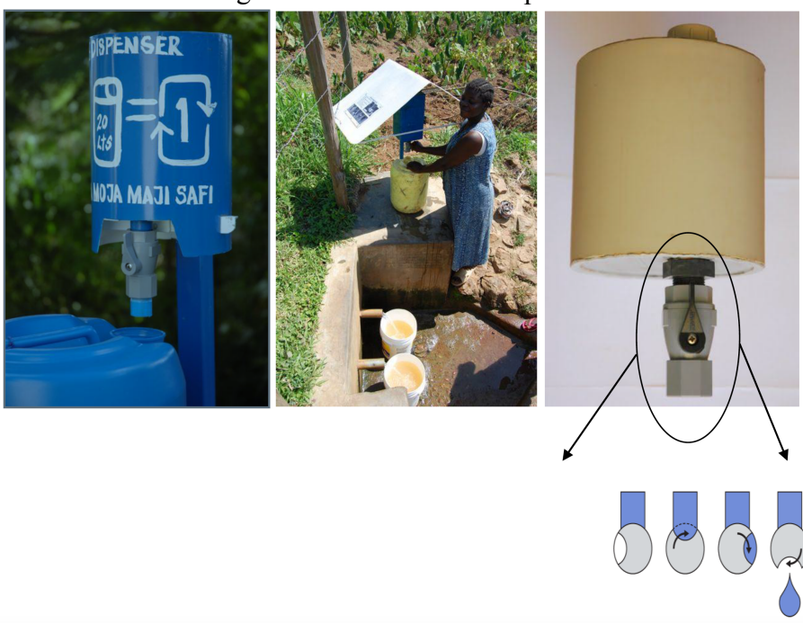
Figure 1: The Chlorine Dispenser