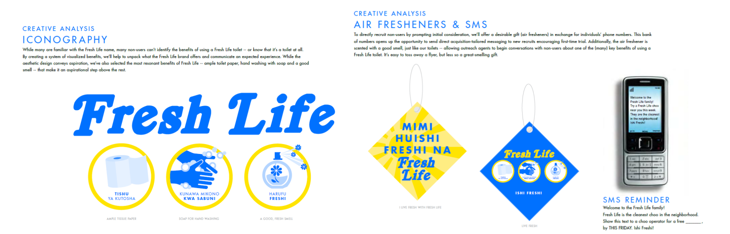
Figure A2: Marketing

Marketing materials and iconography developed by Sanergy, Populist and GRID Impact