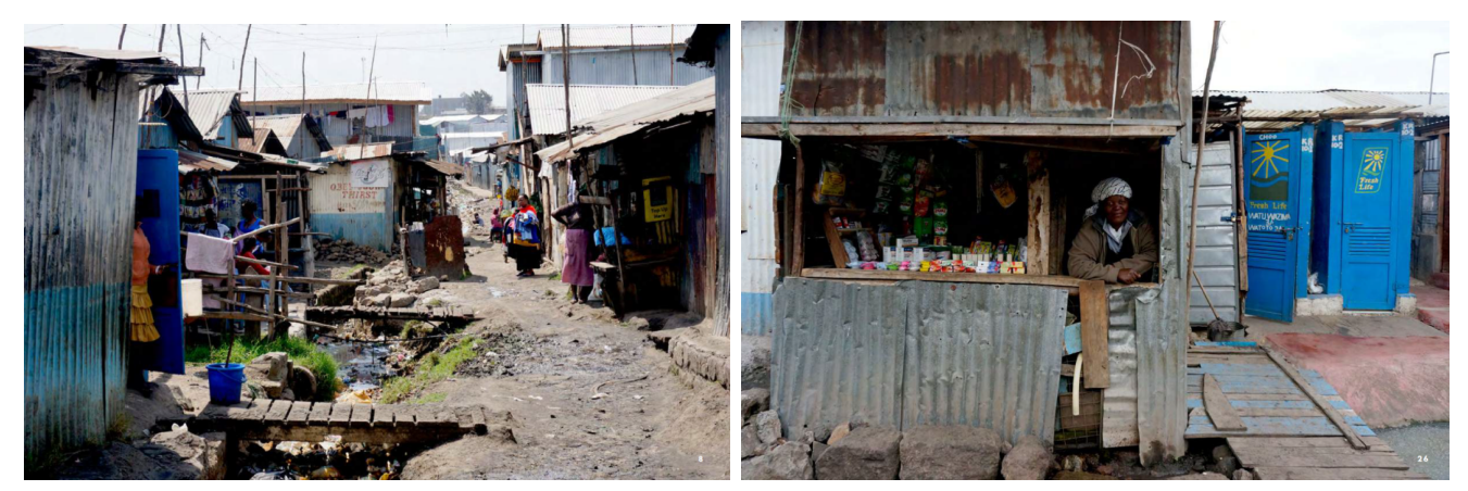
Figure A1: Context

Left panel: A street in the Mukuru settlement where the interventions take place Right panel: A Sanergy franchisee pictured with the FLT toilet business she operates